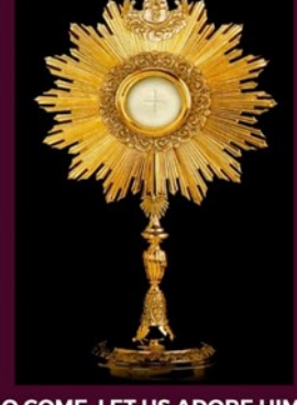
O COME, LET US ADORE HIM, CHRIST THE LORD.